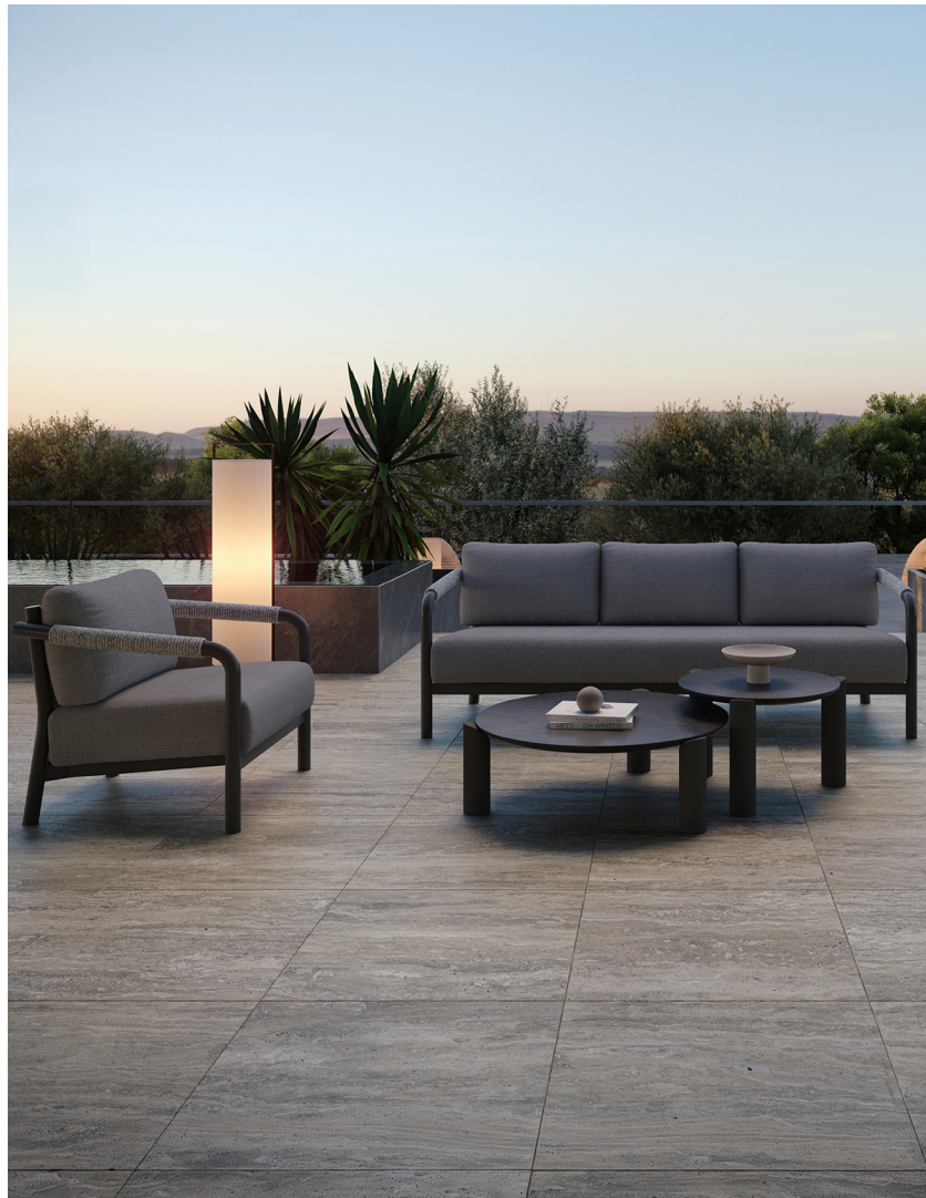
2 SEATER SOFA LUALDI MERALDI STUDIO